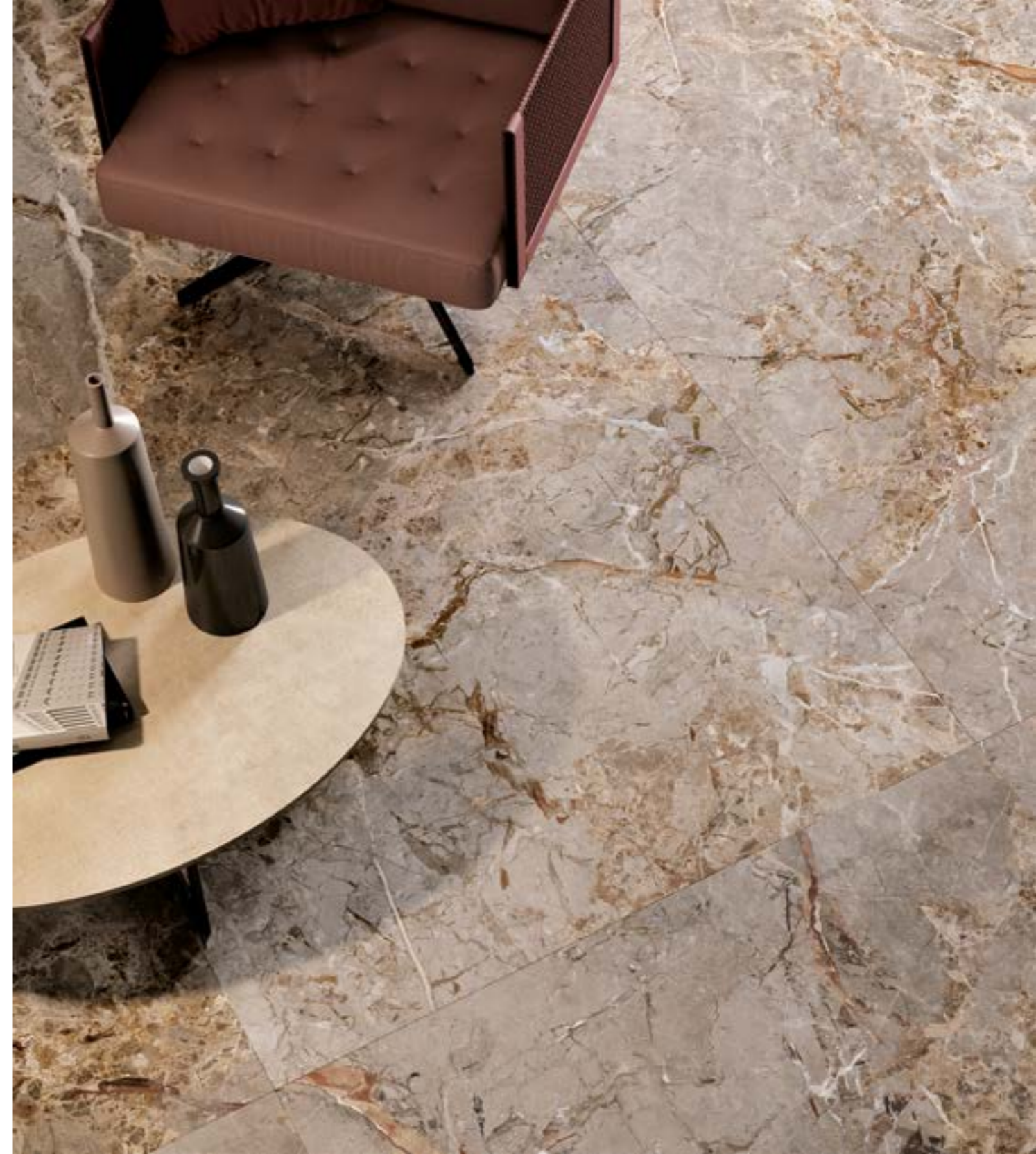
Floor Breccia Argentum 160x320_63"x126" Lap Ret

**A disposizione solo su richiesta. Tempi di consegna: 30gg. Available upon request only. Delivery terms: 30 days. Disponible seulement sur requête. Délais de livraison: 30 jours. Verfügbar auf Anfrage. Lieferzeit: 30 Tage.